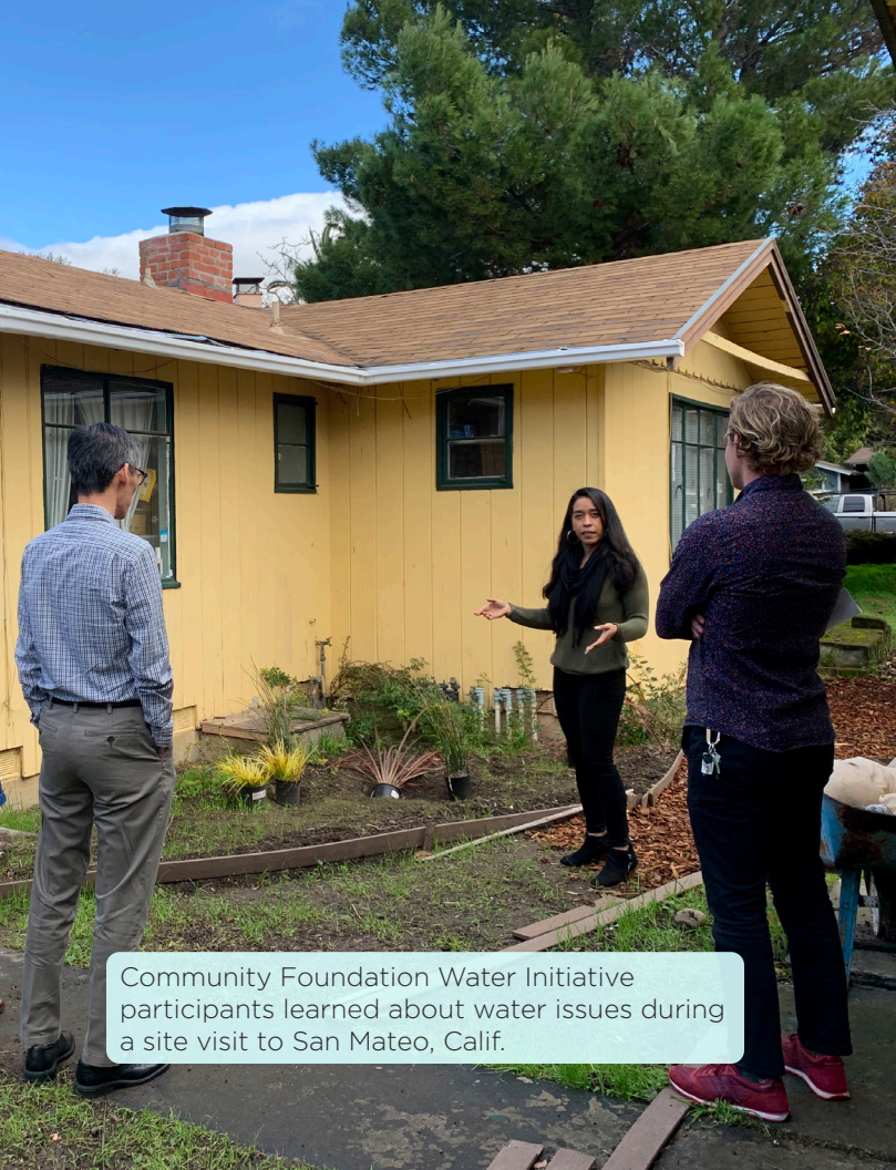
Community Foundation Water Initiative participants learned about water issues during a site visit to San Mateo, Calif.