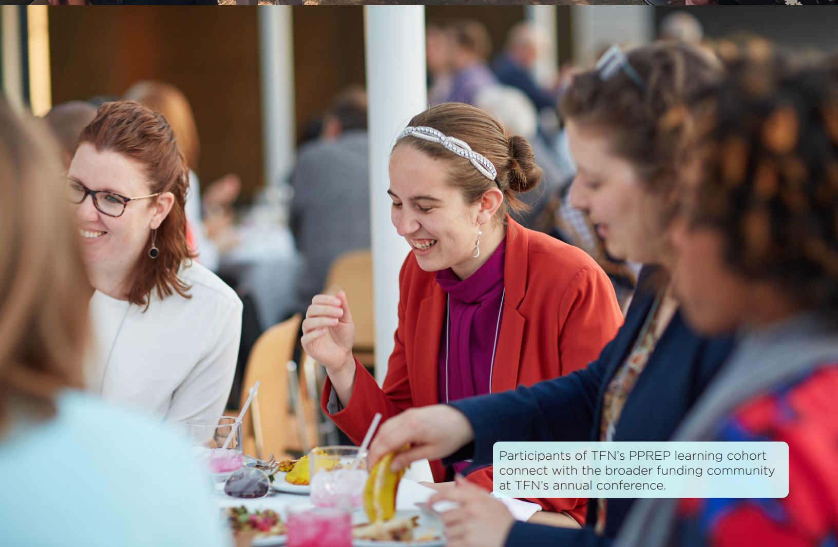
Participants of TFN's PPREP learning cohort connect with the broader funding community at TFN's annual conference.