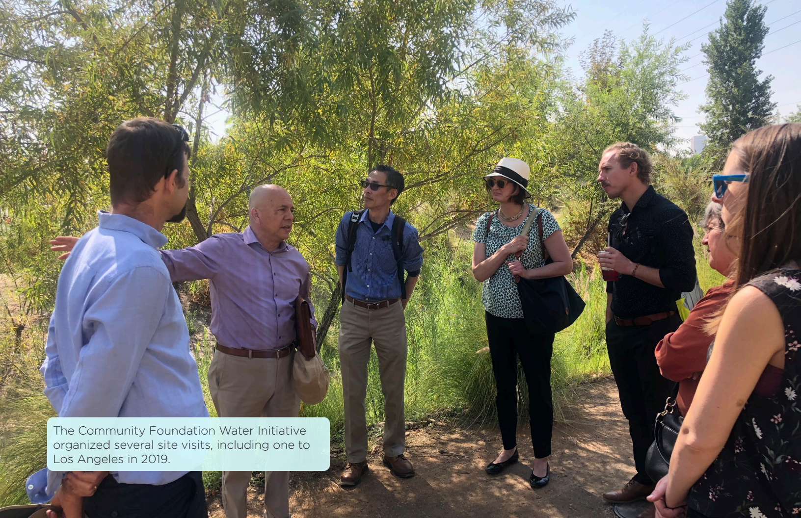
The Community Foundation Water Initiative organized several site visits, including one to Los Angeles in 2019.