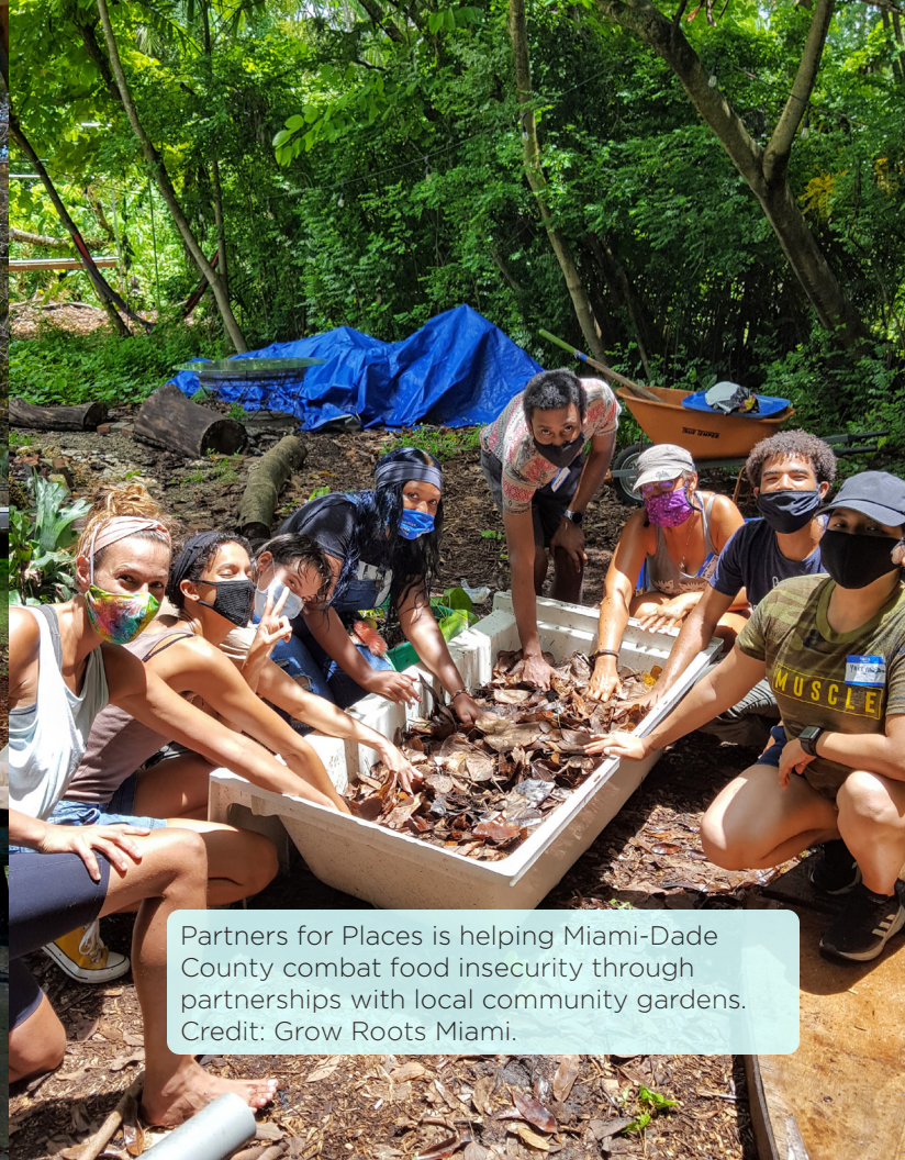
Partners for Places is helping Miami-Dade County combat food insecurity through partnerships with local community gardens.