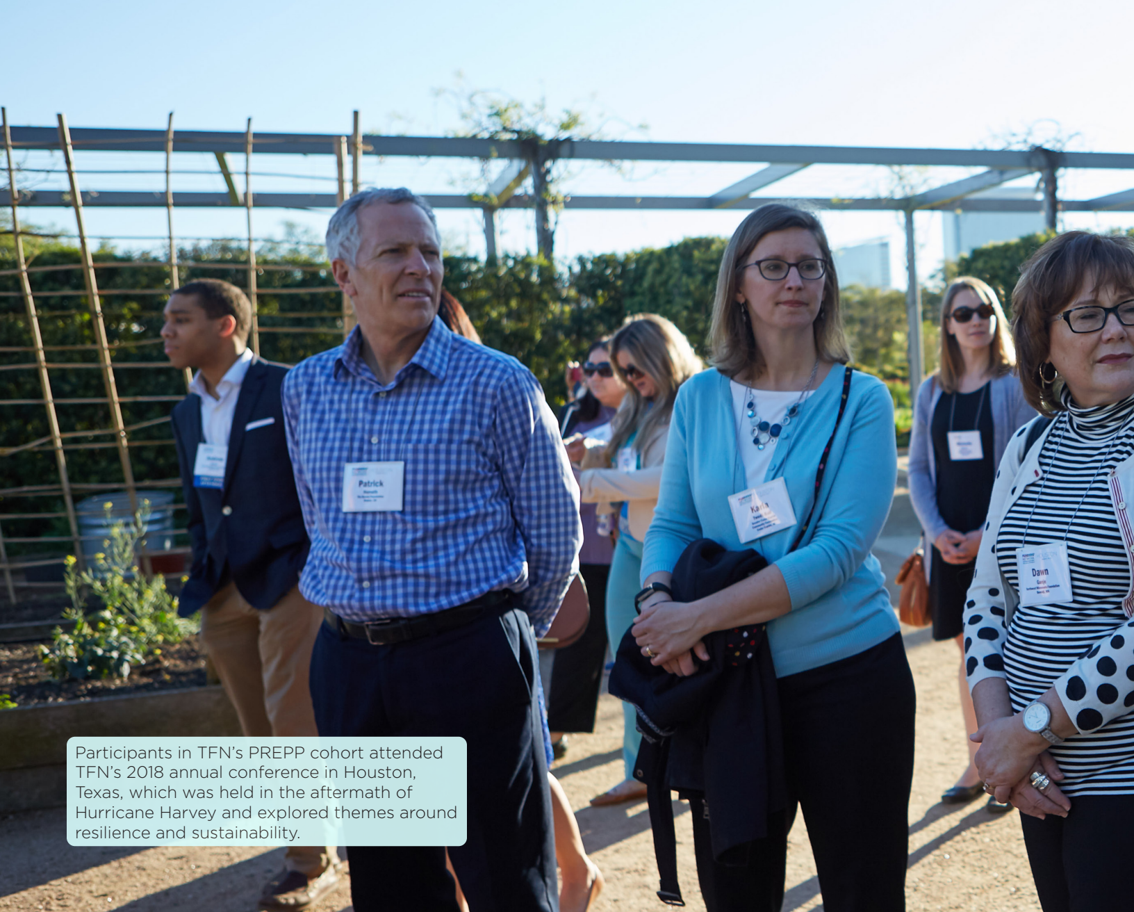
Participants in TFN's PREPP cohort attended TFN's 2018 annual conference in Houston, Texas, which was held in the aftermath of Hurricane Harvey and explored themes around resilience and sustainability.

CDP, that assessed the organization's internal capacity and the external community's capacity to engage in disaster response. CDP also provided the cohort with a technical curriculum centered on addressing disasters along with the importance of community development. In PPREP 1.0 and 2.0, following the workbook process, participating foundations applied for PPREP implementation grants to fund activities needed to fill the gaps and meet the needs highlighted in their assessment. PPREP hosts two annual gatherings, in-person and virtually, that allow the community foundations to share with each other about the successes and challenges they are experiencing in their own communities and the lessons they have learned. The program's emphasis on joint learning and strengthening community resilience encourages community foundations to build relationships between community members and emergency